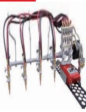
GCD 4 -100 Four torch straight cutting machine