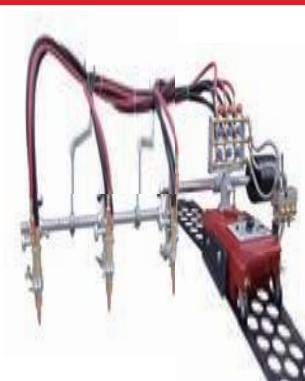
GCD 3 -100 Three torch straight cutting machine